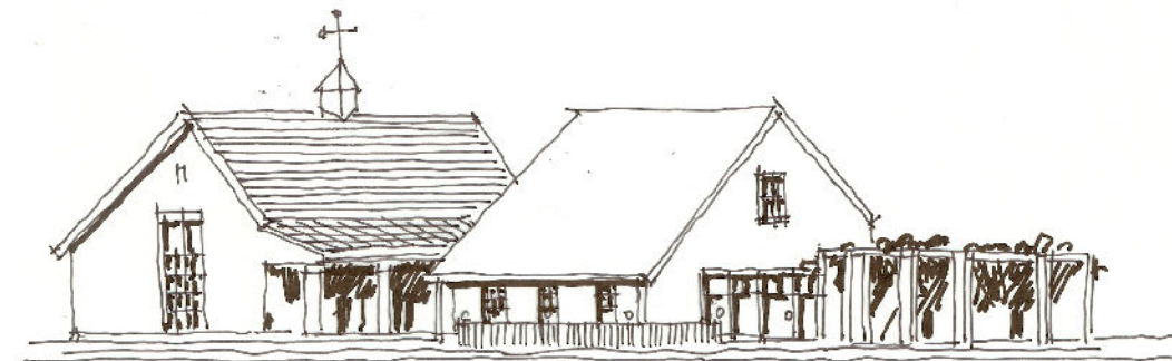
PHASE ONE FARM CLUSTER CHARACTER