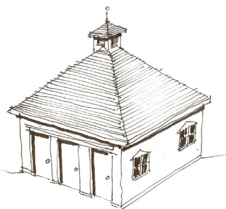
TYPICAL STORAGE BUILDINGS